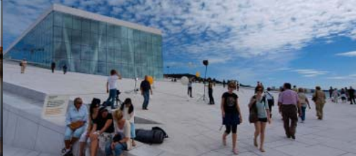
Oslo Opera House