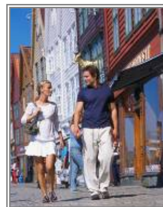
Bryggen in Bergen, Terje Rakke/Nordic Life/Fjord Norway