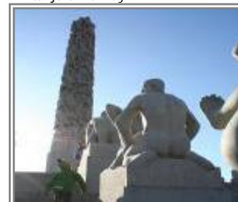
Vigeland's Park