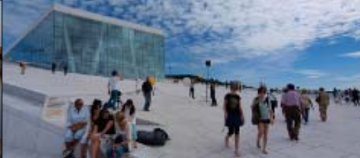
Oslo Opera House