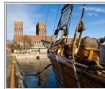
Oslo harbour

One of the ways of experiencing Bergen is to wander its cobblestone streets and narrow alleys, exploring charming neighborhoods of old wooden houses in Sandviken or Nordnes, Bryggen or the Hanseatic Wharf seems to draw you into its wooden walkways and its mediaeval past. Join a guided tour and learn more about life in Hanseatic times. Take the funicular Fløybanen to the top of Mount Fløyen and enjoy the view of the city and surrounding areas. Extend your stay in Bergen by taking a tour to Troidhaugen, Edvard Grieg's home, and enjoy a beautiful piano concert while experiencing the surroundings that inspired his music and art. The Bergen Card entitles you to free or discounted admission to museums, attractions, sightseeing and cultural events, free bus travel and discounts on meals and parking. Go to www.visitbergen.com for more information.