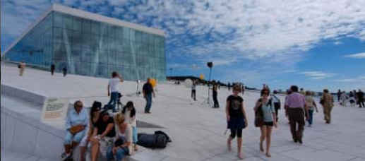
Oslo Opera House